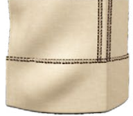
3608 Plain 7cm