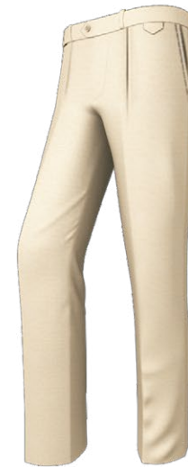
P003 Watch pocket with flap