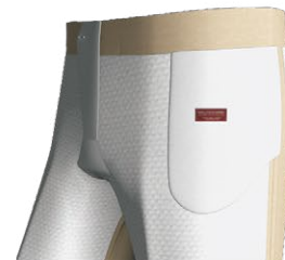
364J Inside right pocket