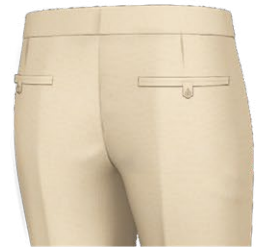
P018 Back pocket with button and point tab