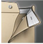
P028 Button through