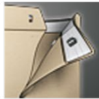
P029 Extension with hook