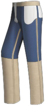
P078 Front and back half lining