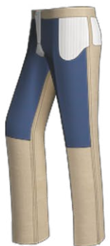
P036 Half lining on front