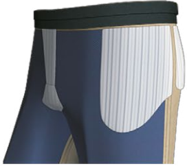
3430 Standard inner waistband