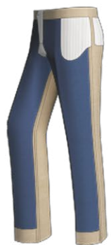
P037 Full lining on front