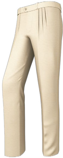
3026 Triplicate pleats forward fly