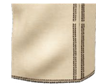
360A Unfinished with 13cm extra fabric