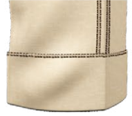
3609 Plain 7.6cm