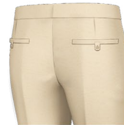
P020 Back pocket with button and round tab