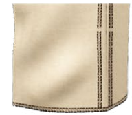
360G Unfinished with 10cm extra fabric