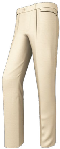
3135 Arc jeans pocket