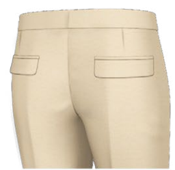
P012 Standard flap back pocket