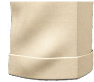
3604 4.4cm cuff