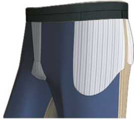
3434 String pleat waistband