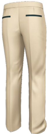
325B Back pocket besom