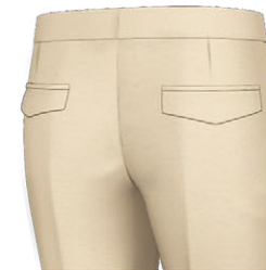
P013 Diamond flap back pocket