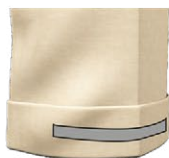
551 Heel guard