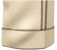
3607 Plain 6.4cm