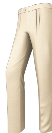
3024 Double pleats forward fly