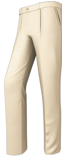
3101 3.2cm slant pocket