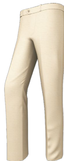
3020 Plain front