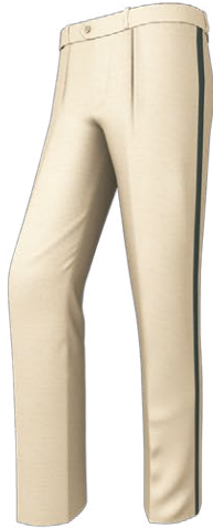
331E Side seam