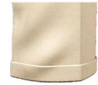
3602 3.2cm cuff