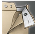
P030 Extension with hook and button