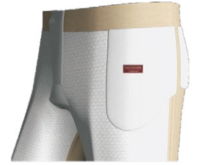
364B Inside left pocket