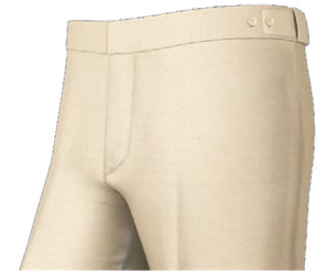
3356 Adjust tab