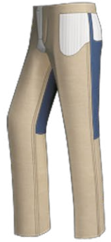
P077 Half lining on back