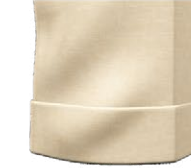
3605 5.1cm cuff