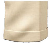
3603 3.8cm cuff