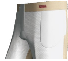
3642 Left center