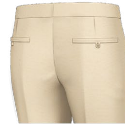
P016 Back pocket with button and loop