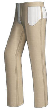
3500 No lining