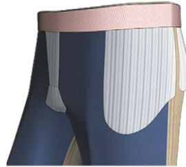
P032 Shirt fabric inner waistband