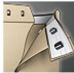
P031 Extension with double hook