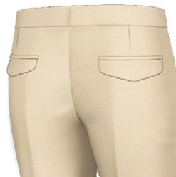
P014 Pointed flap back pocket