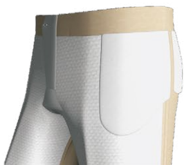
1046 Name label