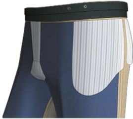
344U Suspender Buttons