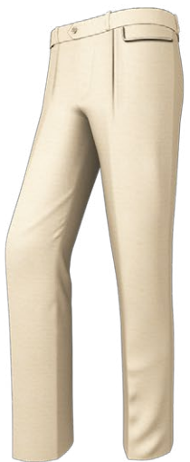
3136 Round jeans pocket