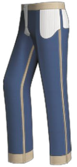
P079 Front and back full lining