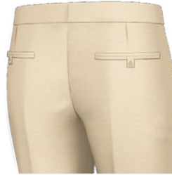
P019 Back pocket with button and square tab