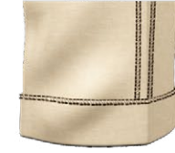
3600 Plain 5.0cm