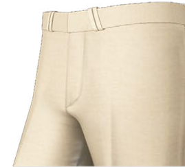
3339 Double slant belt loop