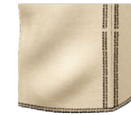
3601 Unfinished with 11.5cm extra fabric