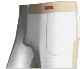
3648 Right center